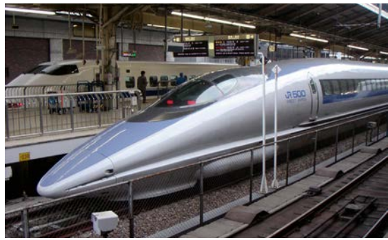
The beak of the kingfisher gave engineers insight into high-speed train design.