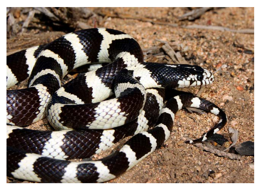
A California kingsnake

How do snakes slither so easily? There is no obvious difference in the structure of snake scales on their upper and lower surfaces. However the scales of the lower surface produce less friction. This allows the snake to move across rough surfaces without damaging its skin.