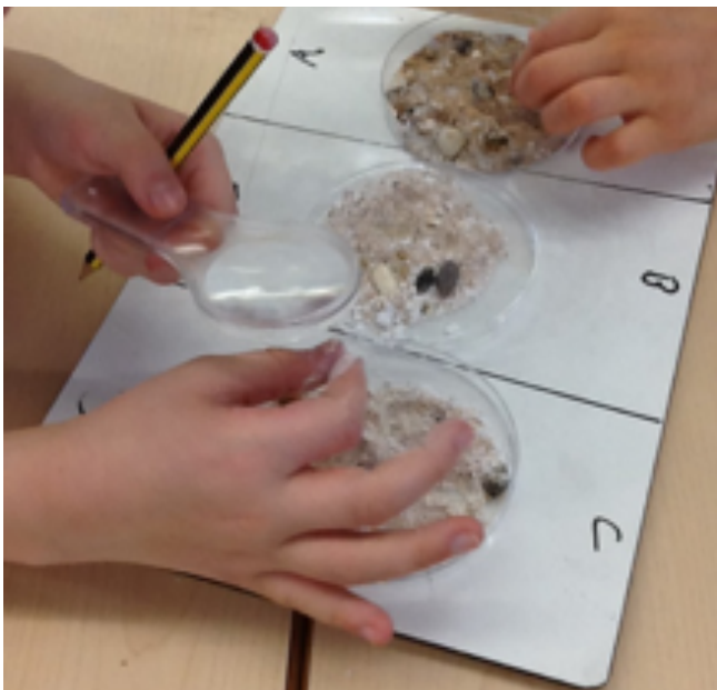
► Analysing Martian soils at Damer's First School

In summary, the TPPP was a well-managed project that had a positive impact on pupils' enjoyment, engagement and attainment in science and, to some extent, in other areas of the curriculum too. It also helped to improve teacher confidence in teaching space topics and raised the profile of science in schools. Over the longer term, this impact has been sustained in schools that have continued to use the TPPP resources. The use of authentic contexts, such as space, as a context for learning has also increased and schools have registered for other projects, similar to the TPPP. The impact of the TPPP extends beyond schools registered for the project: networking between schools has increased as well as schools' community engagement.