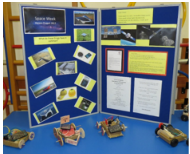
► Solar-powered buggies made by Heron Class, Ludham Primary School

in a number of cases, for schools' later engagement with other projects that promote context-based approaches to cross-curricular teaching and learning. The impact of the TPPP also stretched beyond schools, as teachers were able to engage parents, grandparents and the wider community as well as networking with other schools not registered with the project.