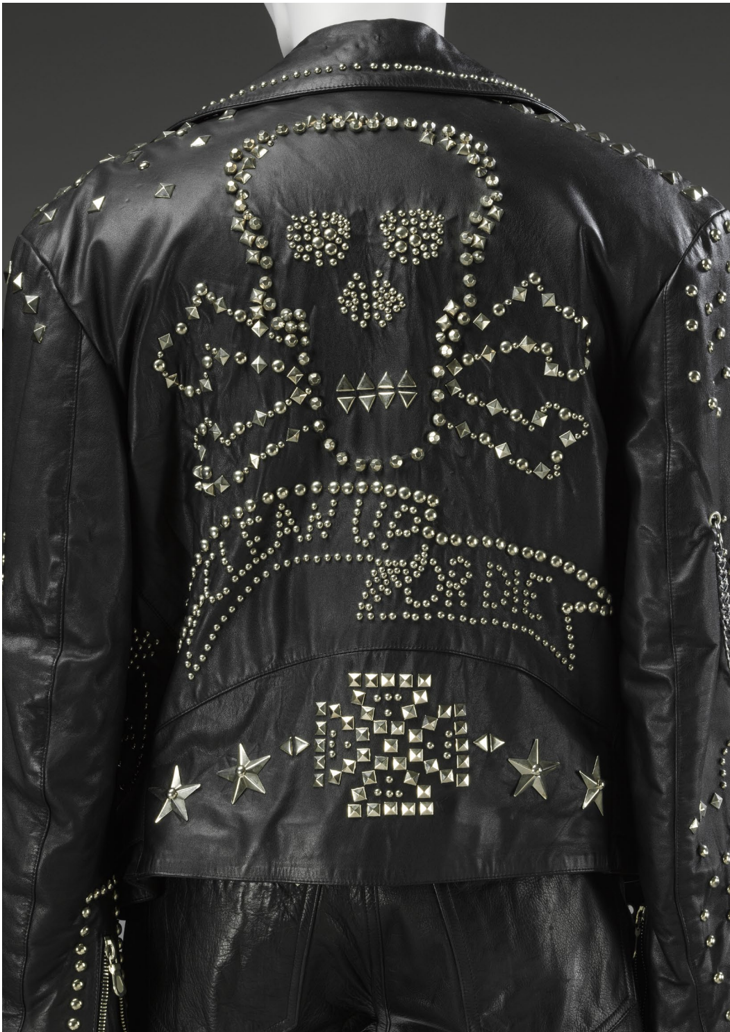
Clean Up or Die, Katharine Hamnett, 1989 Given by the designer.