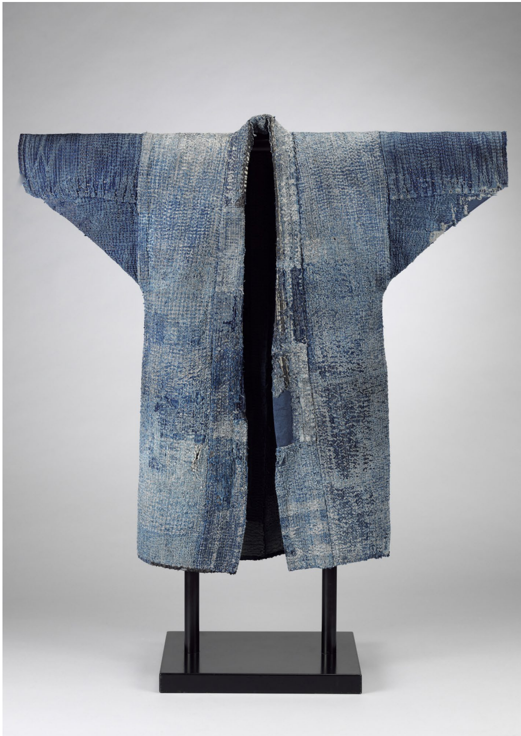
Robe, made in Japan, 1850-1900