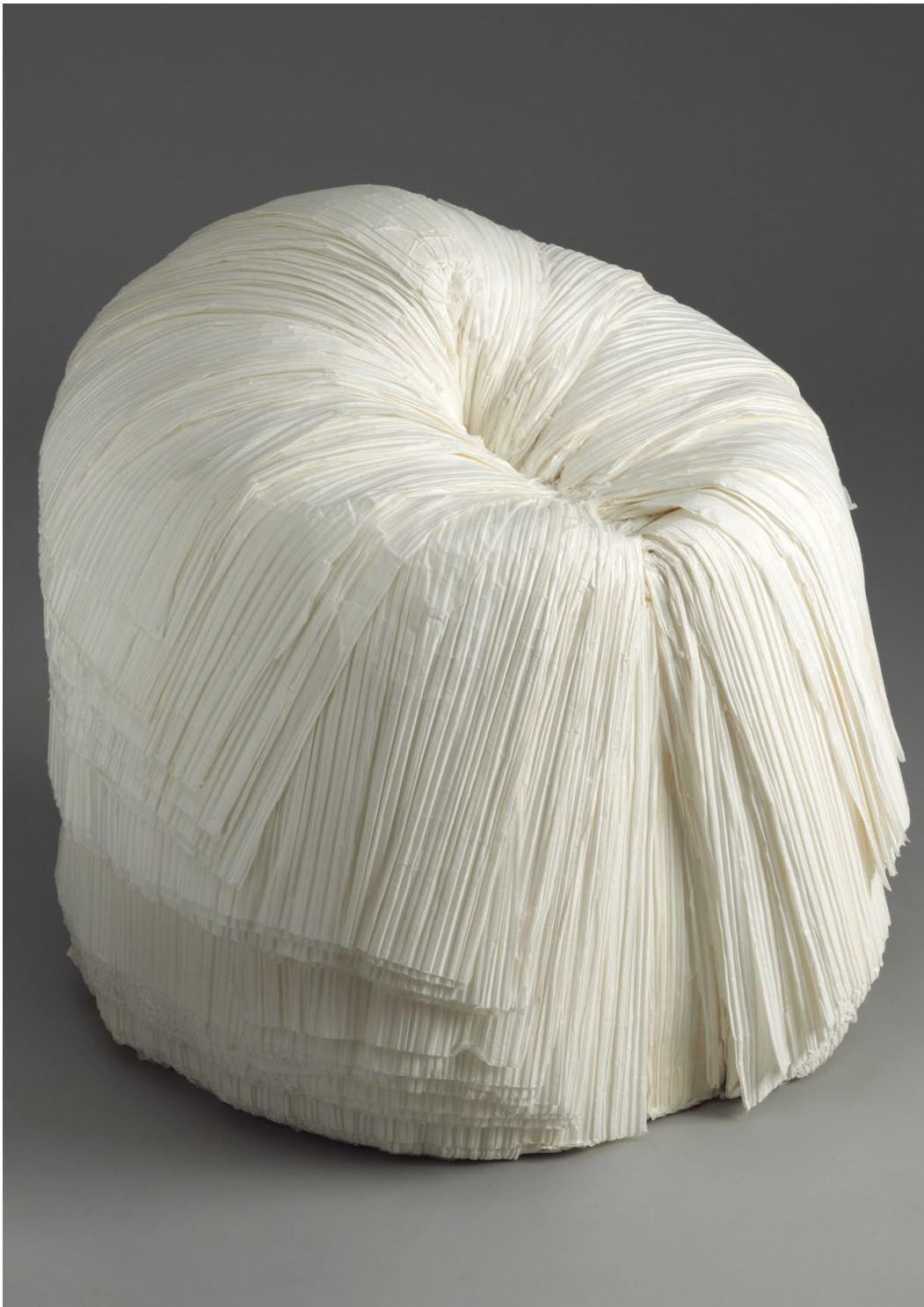
Prototype Cabbage Chair, Oki Sato, 2008