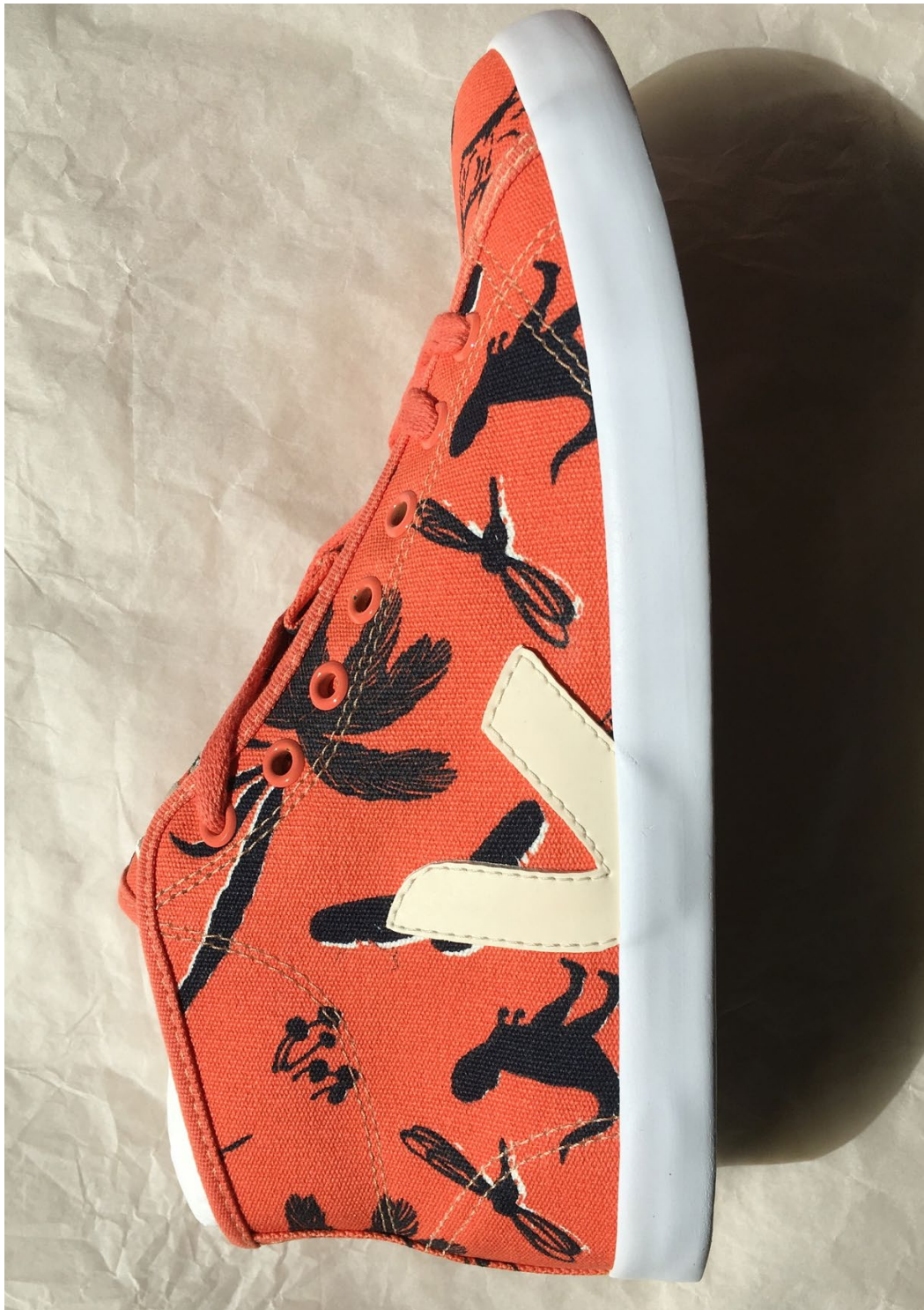
Taua Amazon, designed by Lily Cole with Veja, 2014