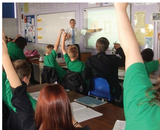
Figure 3 The author teaching cells in the topic 'Human Survival', a biology module taught using the context of human space exploration

out about these careers using a variety of media and resources that allow them to see that careers in science are varied and interesting.