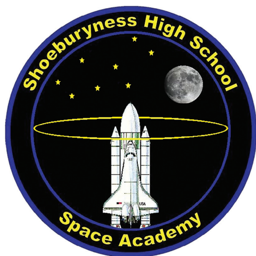
Figure 1 The Shoeburyness High School Space Academy logo, designed by Space Club members, is used on all teaching resources related to the Space Academy course

The context of space travel was an obvious choice for a topic on forces. The Science team decided on a final context which includes a mini-project on spacecraft design that looks at the properties of materials and uses a series of practical