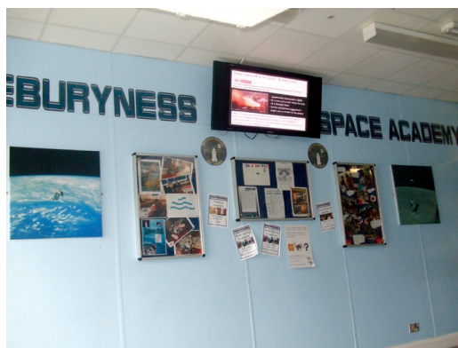
Figure 2 The entrance to the Science Department, rebranded as 'Shoeburyness Space Academy' with space-related canvases

A careers-focused module allows students to investigate the work of a range of people in the space industry, including engineers, physicists, managers, designers and graphic artists. They find