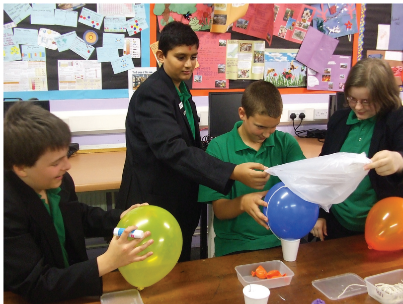
Figure 5 Year 8 Space Academy students building Mars landers

to preparing schemes of work and resources, and this was made easier with consultation early in the planning process.