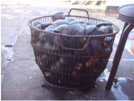
Clams are also dredged for food.

We have been able to use radiocarbon measurements in the shell to show how the source of ocean water north of Iceland has changed over the past thousand years from a predominantly Atlantic origin to a predominantly Arctic origin, and that there are indications that this trend may have reversed in recent decades, possibly linked to modern global warming. We have also been able to use carbon isotopes in the shell to show how the uptake of fossil fuel carbon from the atmosphere into the ocean has changed during the past few hundred years. Up until now the ocean has been a major sink for anthropogenic ('man-made') carbon, and long term records such as that provided by A. islandica will help us to detect any signs that the oceanic sink is becoming saturated.