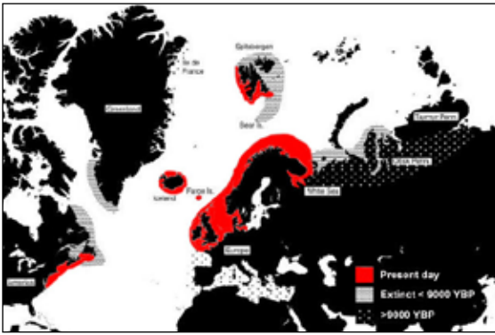
The distribution of Arctica islandica around the North Atlantic ocean