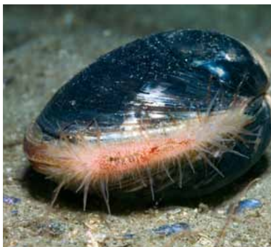
A live specimen of the mollusc Arctica islandica

In the summer of 2006, scientists collecting material from the seabed off the north coast of Iceland found some clam shells. Now, that doesn't sound all that exciting, but it turned out that they came from animals that were quite remarkably long-lived, several of them having lived for more than 300 years, and one that had lived for an amazing 507 years, making it the longest lived non-colonial animal whose age scientists have been able to measure accurately.