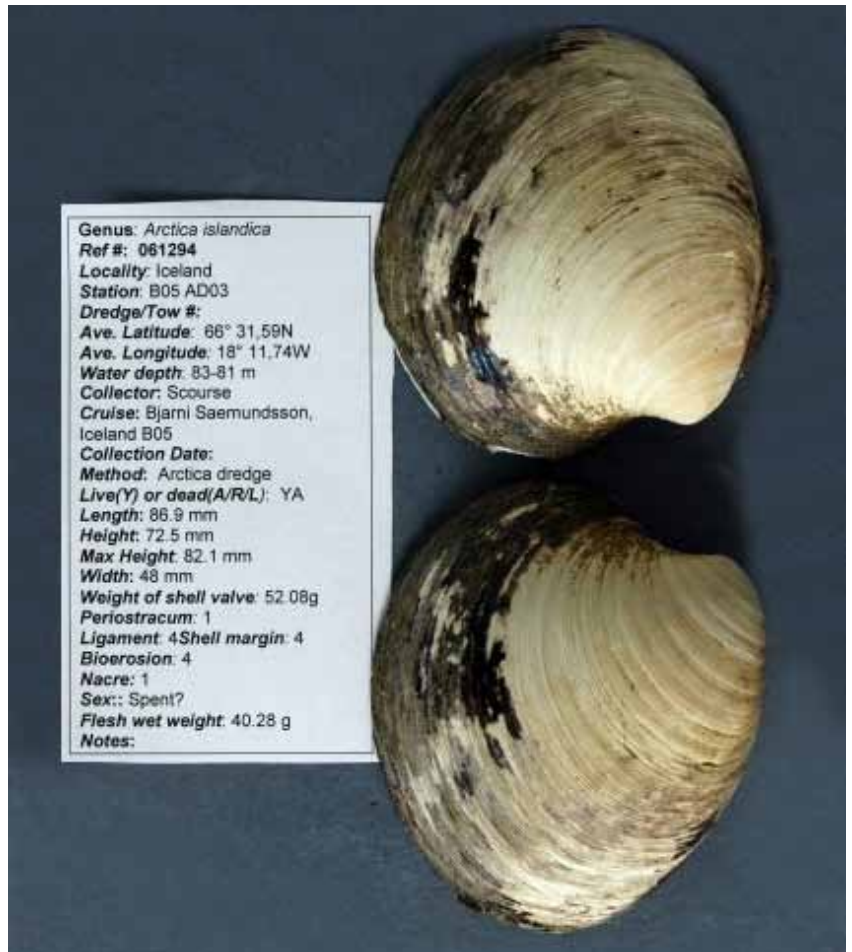
A specimen from a recent dredging exercise near Iceland

First, we can investigate the width of the growth increments. This is just an indication of how much shell material the animal was able to produce in a single year. The most direct relationship is probably with food supply, but it may also record other factors, such as seawater temperature or the presence of ice at the sea surface, especially in regions where the animal is stressed by one of those factors.