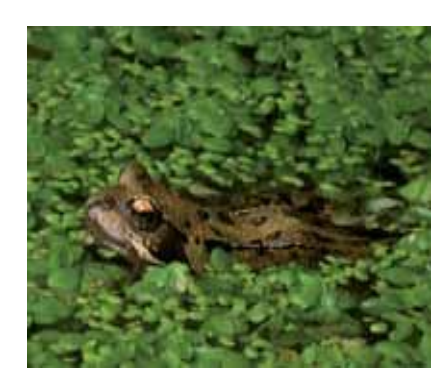
An amphibian: Common frog Rana temporaria