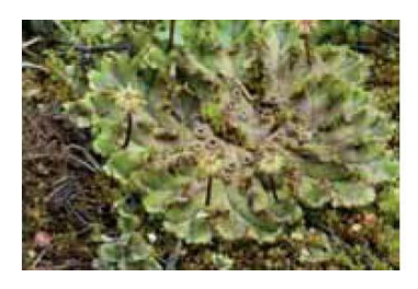
A thalloid liverwort Marchantia