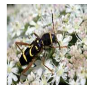
An insect: Wasp beetle Clytus arietis