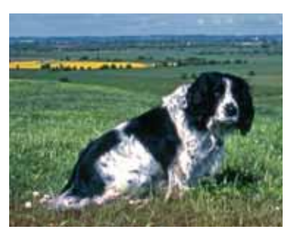
A mammal: Dog (English springer spaniel)