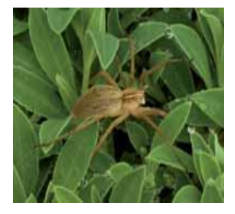
An arachnid: Nursery-web spider Pisaura mirabilis