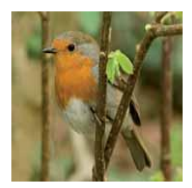
A bird: Robin Erithacus rubecula