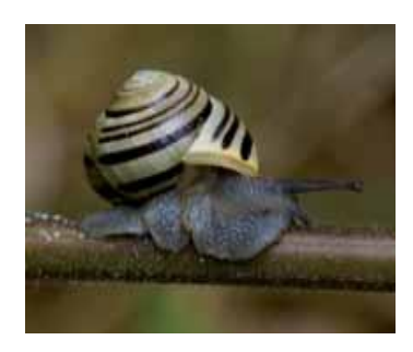
A mollusc: Banded snail Helix hortensis