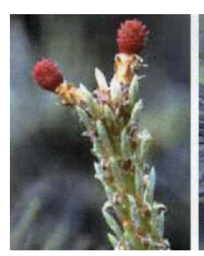
Male and female 'flowers' of Scots Pine Pinus sylvestris