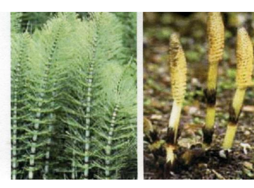
Horsetail Equisetum telmateia