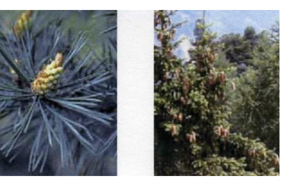
Norway Spruce Picea abies with cones