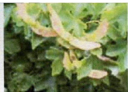
Field Maple Acer campestre Flowers and fruit