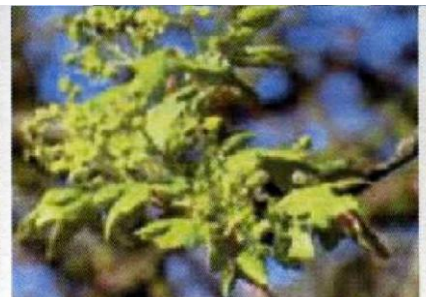
Field Maple Acer campestre Flowers and fruit