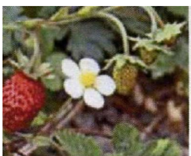
Wild strawberry Fragaria vesca Flowers and fruit