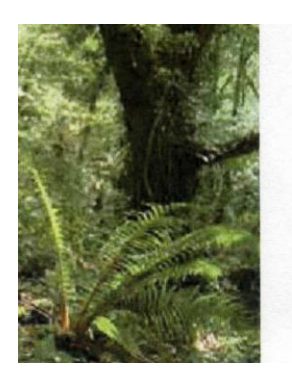
Male Fem Dryopteris filix-mas