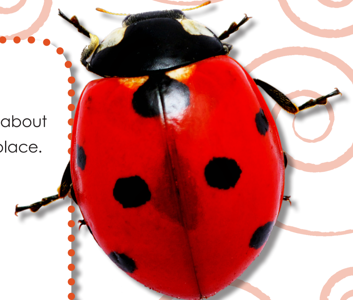
Coccinella septempunctata BRIGHT RED SEVEN POINTS

SPECIES: septempunctata (sept-em-punk-tata) means SEVEN POINTS