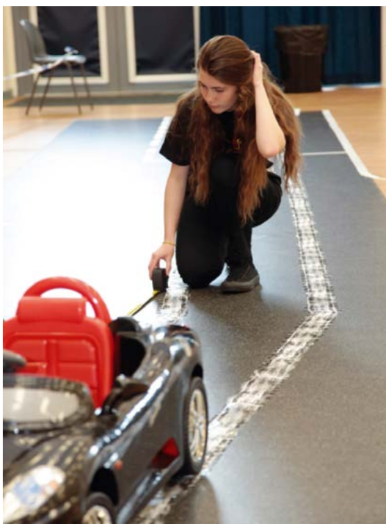
A student measures the skid marks

Tyre marks: Crash investigators measure tyre marks to determine the speed of the vehicle prior to impact and when the car started to skid. The tyre marks can indicate whether a car was accelerating, decelerating or sliding sideways.