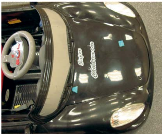
The car was damaged where it was struck by the victim during the collision.

In our accident the pedestrian was run under so his initial velocity was the instantaneous velocity of the vehicle. He travelled through the air straight ahead of the vehicle until hitting the ground and was found a long way in front of the car which had decelerated to a halt. He had marks on his upper right leg, right abdomen, right shoulder and on the right side of his head. The car had marks on its bumper, the top of its bonnet and the windscreen.