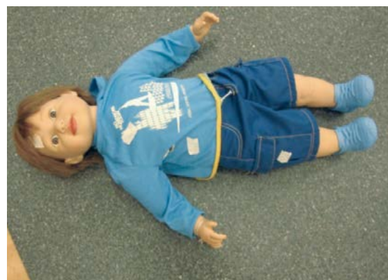
The tags on the victim's body shows where he was hit during the collision.

Pedestrian collision: The body of the pedestrian and the car bear different marks depending on where and how they hit each other. If the pedestrian is hit below the waist, the body is thrown upwards and the vehicle passes under the pedestrian, so the pedestrian is 'run under'. If the pedestrian is hit above the waist, they are knocked down and 'run over'.