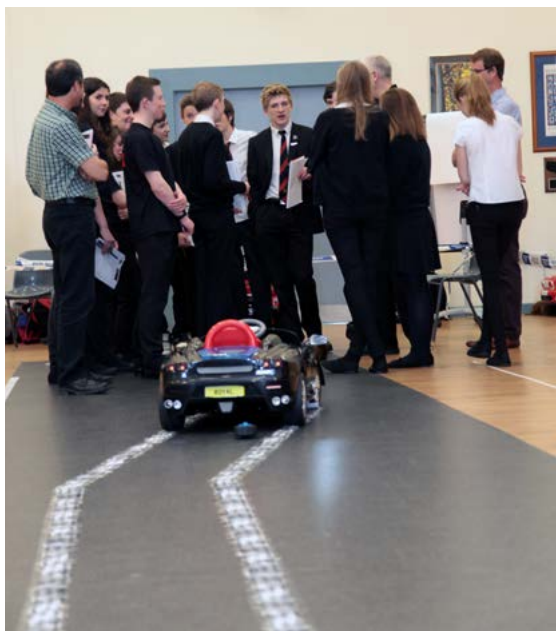
Investigations start at the mock-up of the crash scene.