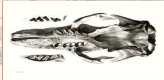
Darwin collected fossils – this is the skull of an extinct ground sloth from Argentina.