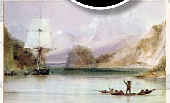
HMS Beagle in the Magellan Straits, observed by native people of Tierra del Fuego.