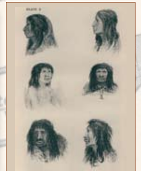
Darwin encountered many native people – these are Fuegians.