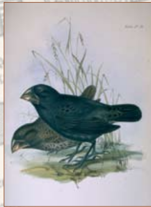
A heavy-billed finch from the Galapagos, a key clue to the idea of natural selection.