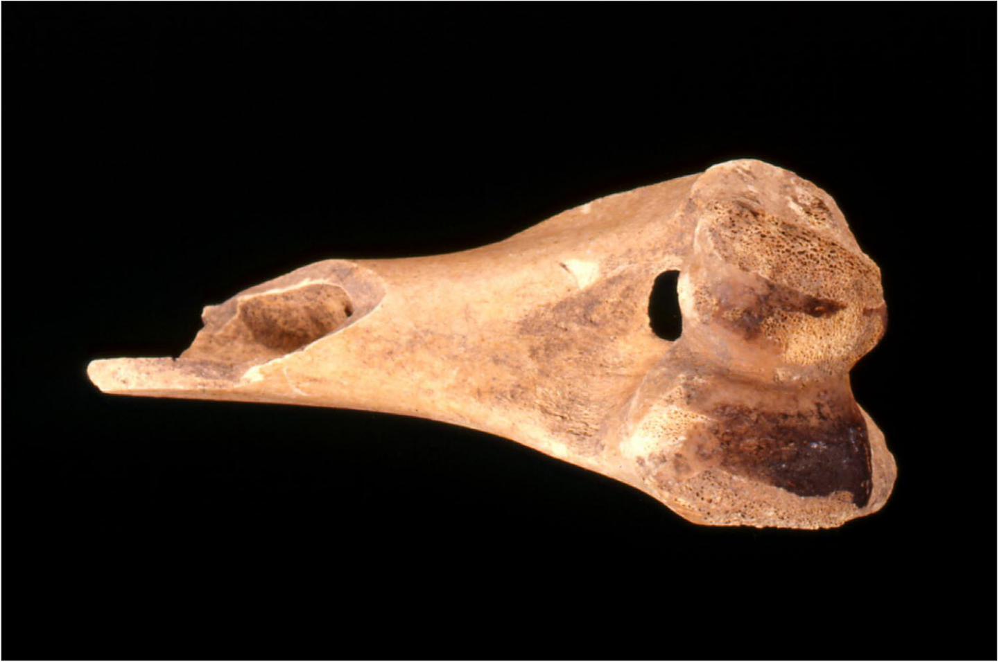
DW Burnt pig humerus

3. Around 80,000 animal bones, probably from at least 1,000 animals, have been found in the middens at Durrington Walls.