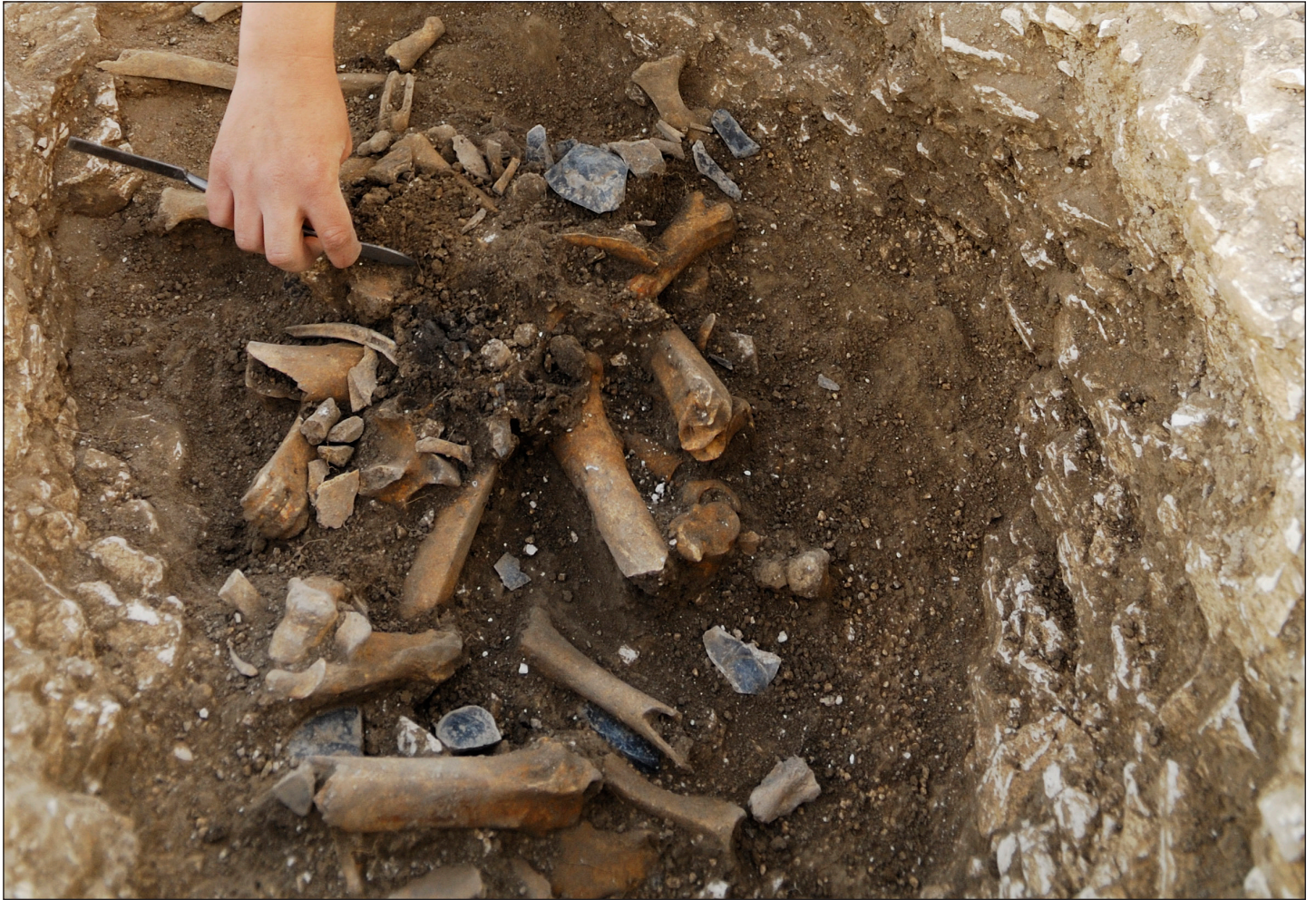
Durrington Walls pit excavation

4. Some of the animal bones found were connected together by a joint.