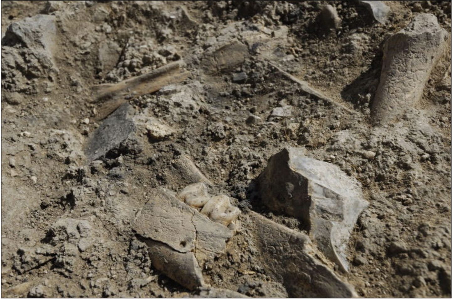
Durrington Walls excavations | Stonehenge Riverside Project

6. Some of the bones of animals were found to have cut marks made by flint tools.