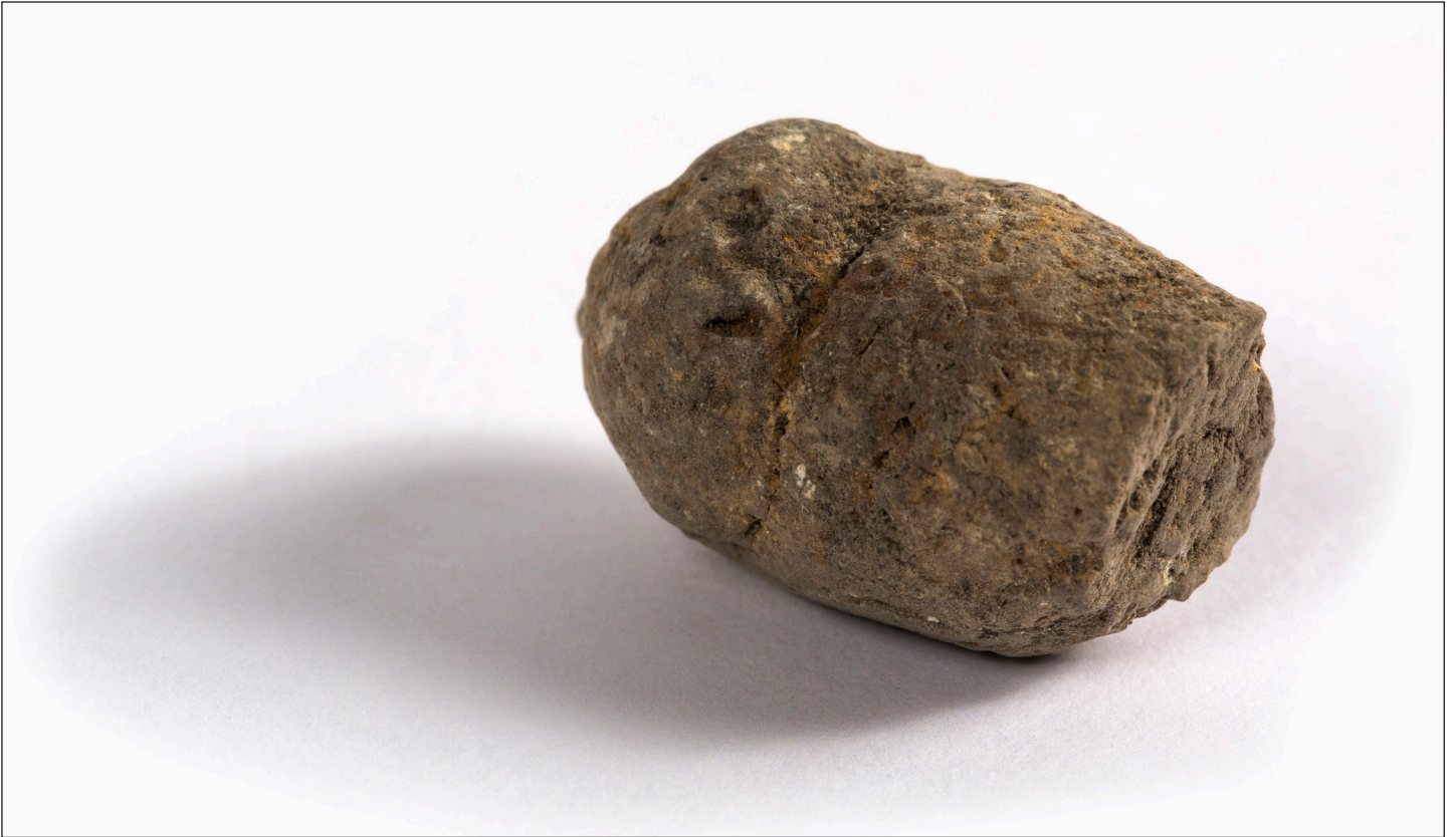
Coprolite | Stonehenge Riverside Project

8. Scientists have found samples of over 4,000-year-old mineralised human poo at Stone Age sites such as Durrington Walls.