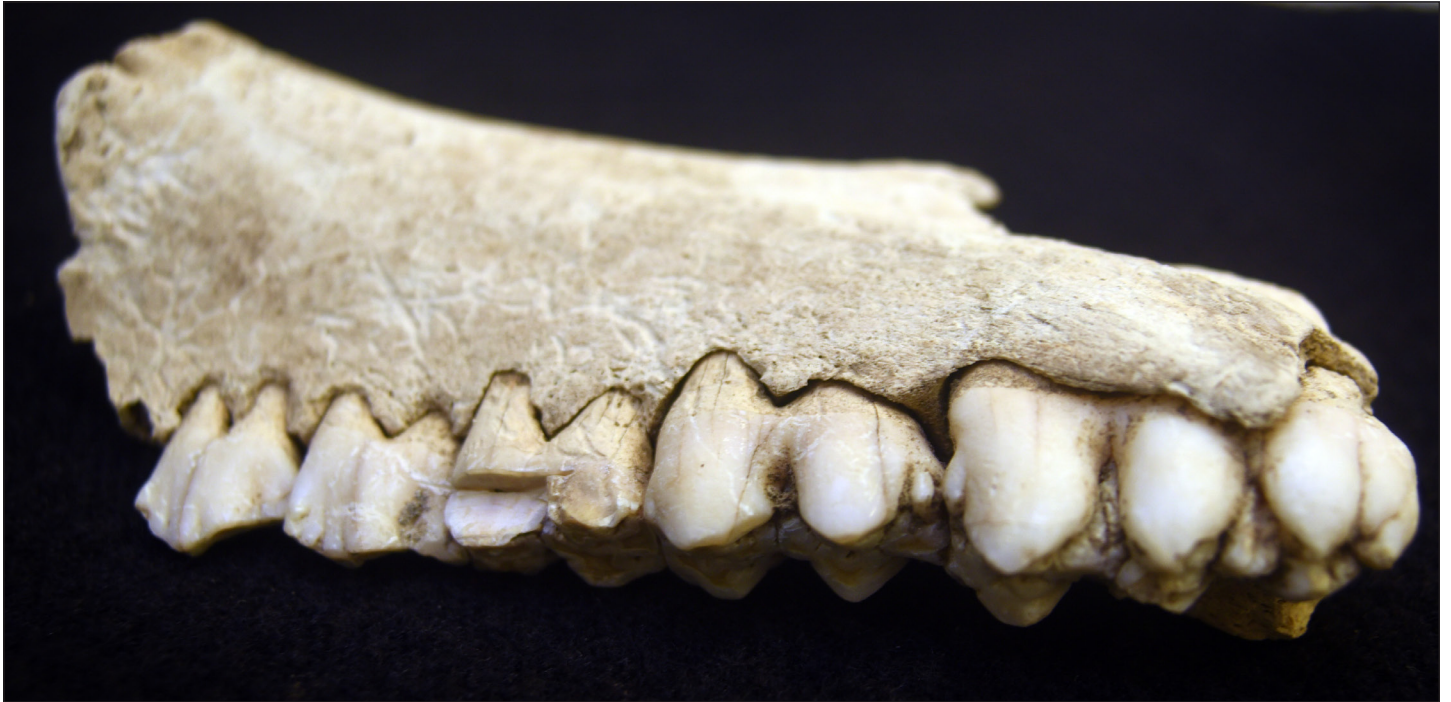
Pig teeth with sampling | Stonehenge Riverside Project

7. Pig teeth found at Durrington Walls suggest that some of the pigs were reared in different places, such as west Wales, northern England and north-east Scotland.