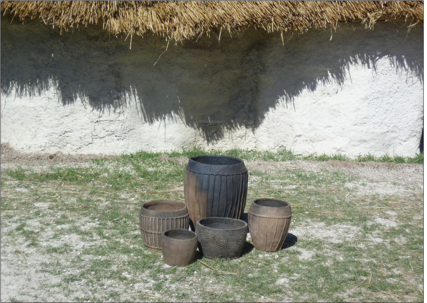
Grooved Ware pots (replicas)

2. Scientists can identify different types of food found absorbed in pieces of clay pots. At Durrington Walls, the pots were mostly found to contain milk, port and beef fats.